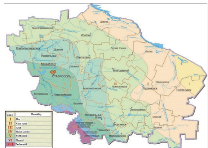
Figure 2 Climatic zones of the Stavropol Region in terms of humidity

The specialisation of agricultural production influences the level and sustainability of rural development in those areas. Analyses of decided differences in social, environmental and economic development of separate